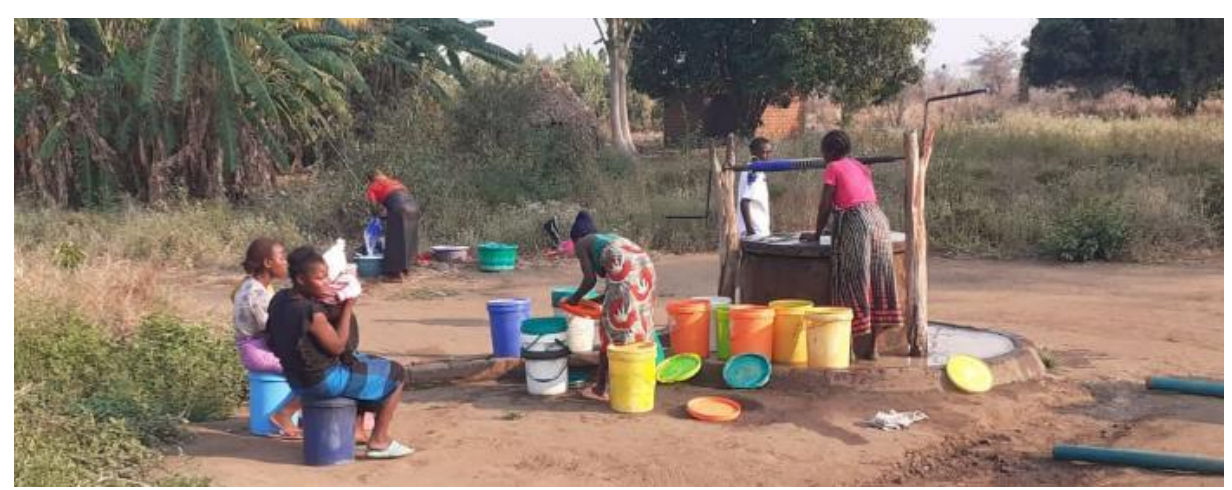
The well in use – it dries up by September each year. The water isn't clean and has to be boiled for drinking.