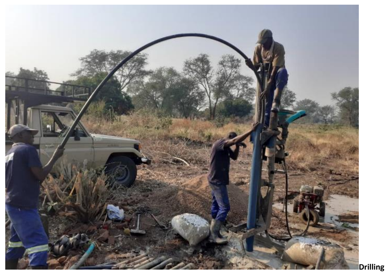
underway at Simuponda