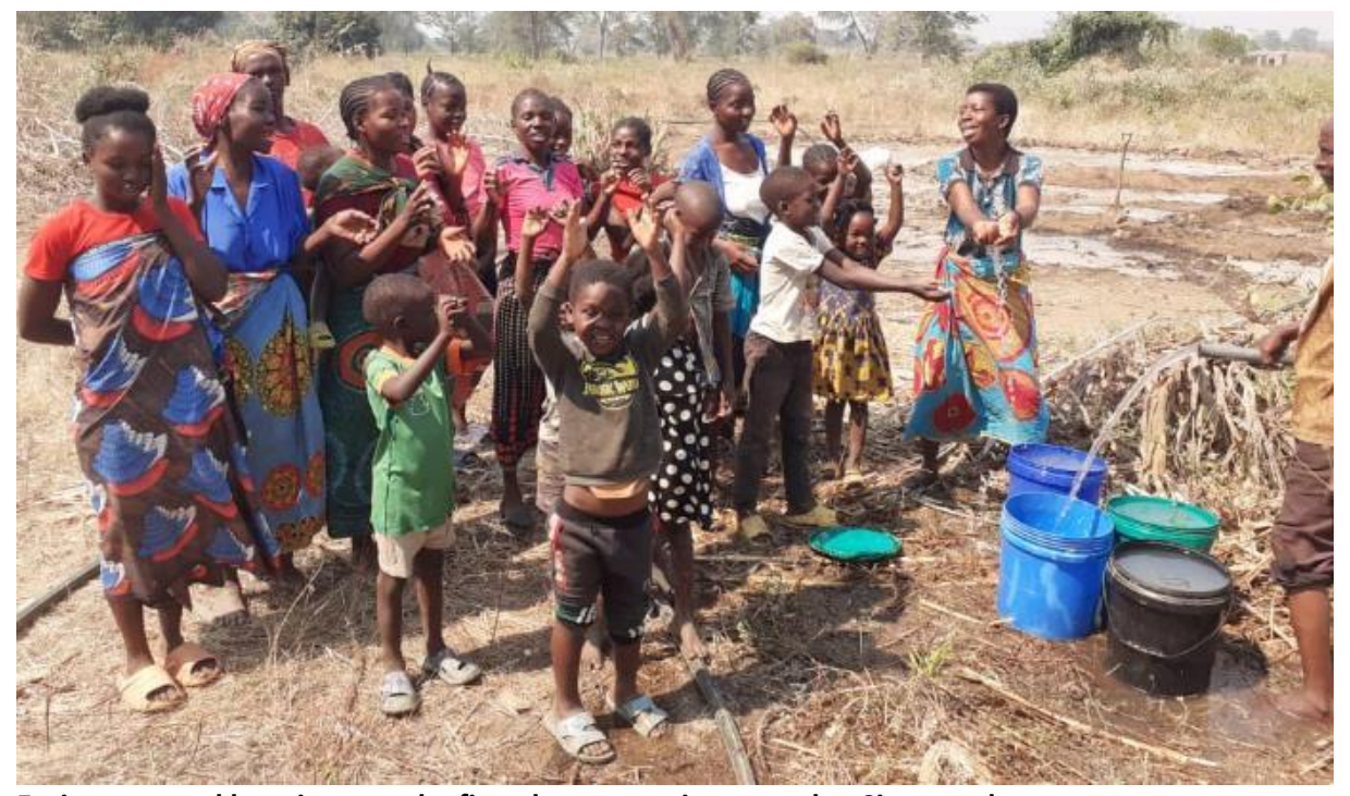
Excitement and happiness as the first clean water is pumped at Simuponda