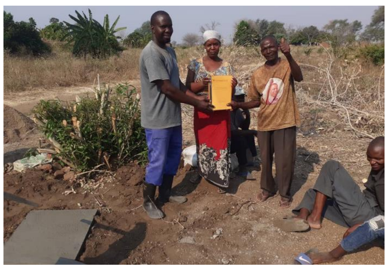
The Chair and vice Chair of the Simuponda borehole committee receive their training and handbook